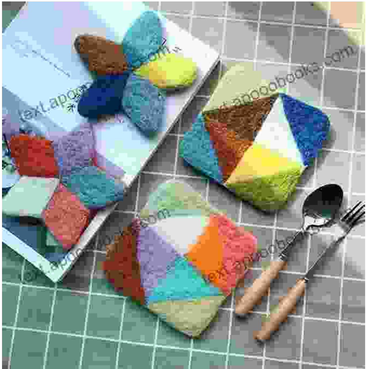
Create colorful and practical coasters using simple wet felting techniques