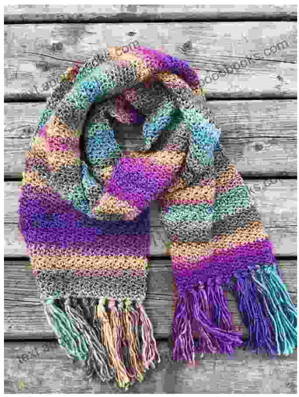
The Magic of Single-Handed Knitting

With single-handed knitting, you'll be amazed at how easy and enjoyable it is to create beautiful scarves, hats, and other knitted accessories. Unlike traditional knitting methods that require two hands, our simplified technique allows you to knit with just one, making it accessible and convenient for everyone.