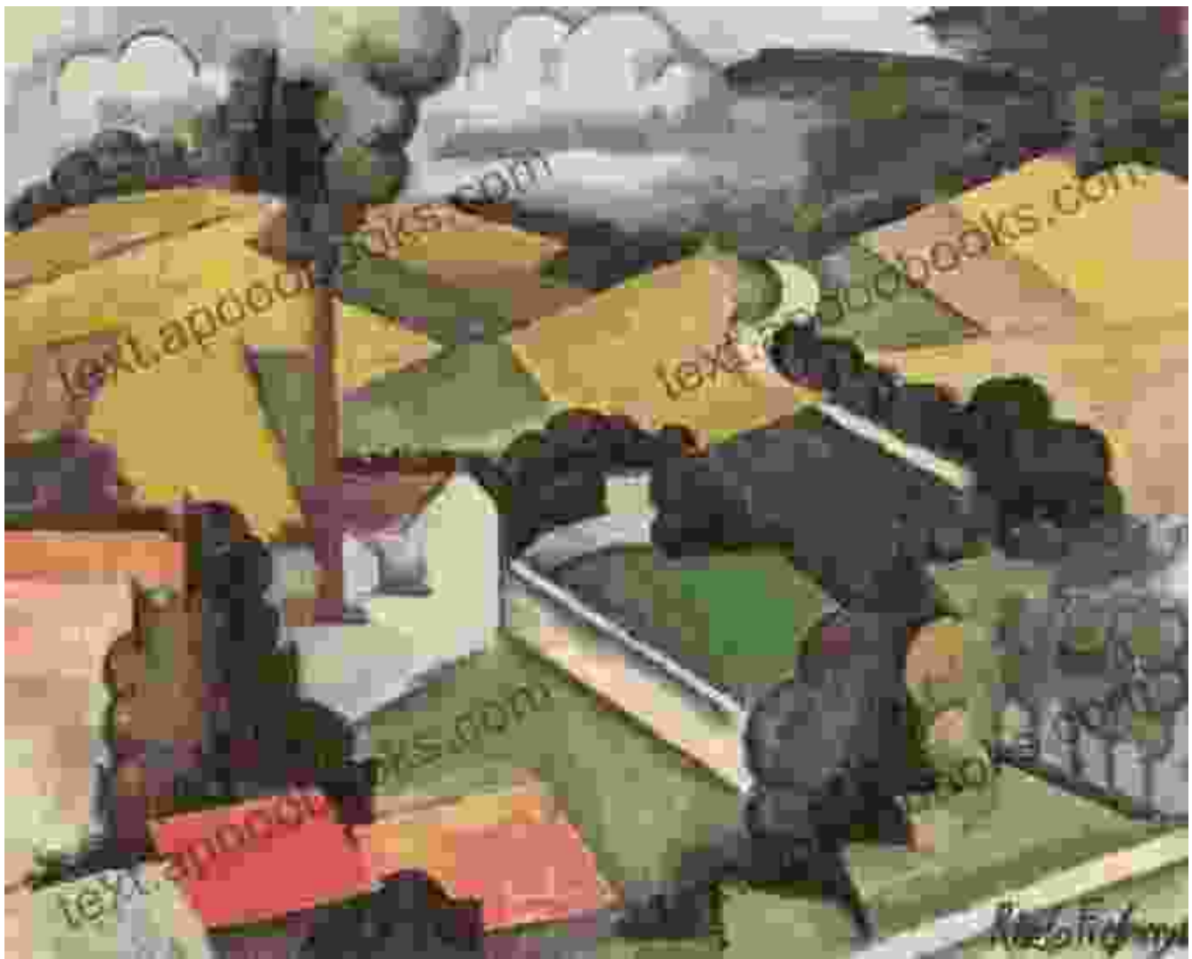
The Factory Chimney, Meulan Landscape Cross Stitch Pattern - Roger de la Fresnaye: Regular and Large Print

Prepare to be mesmerized by "The Factory Chimney Meulan Landscape Cross Stitch Pattern," a stunning masterpiece that will ignite your passion for the art of cross stitch.