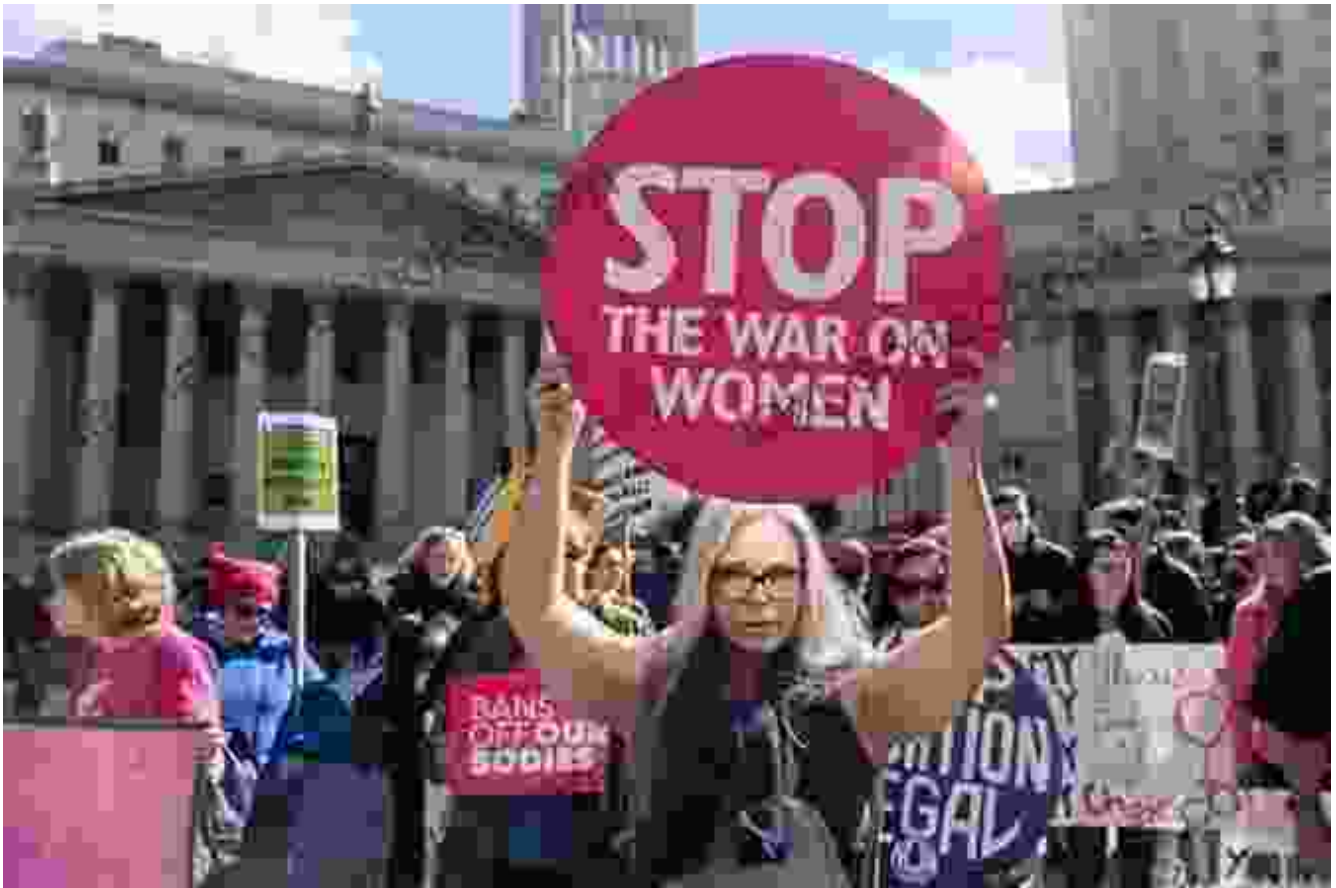
Image: People protesting for reproductive rights.

Together, let us embrace the principles of reproductive justice and work towards a future where every person has access to the healthcare and autonomy they deserve.