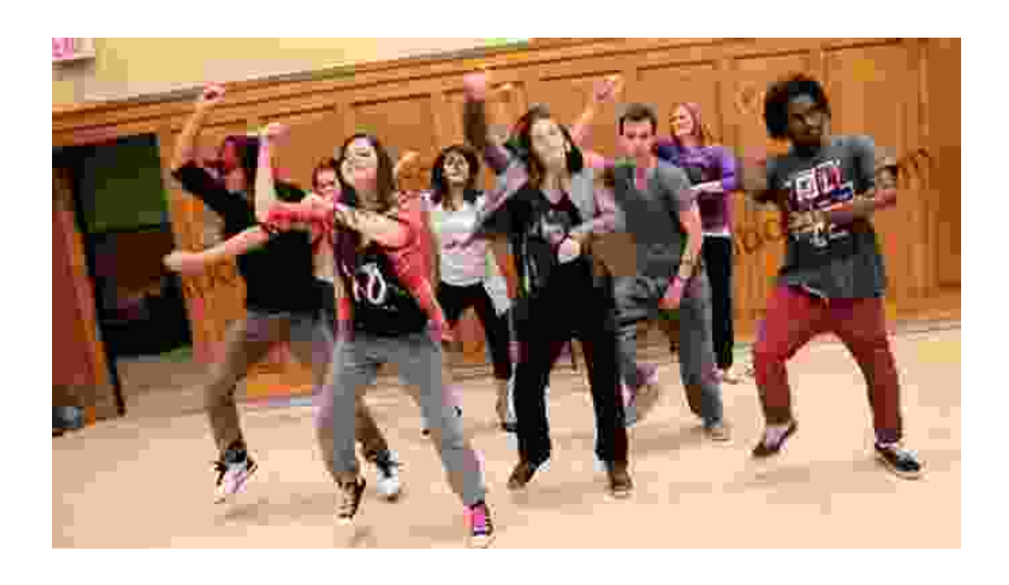
The Gangnam Style Dance - Taking the World by Storm

The Gangnam Style dance is a global phenomenon that has had a significant impact on popular culture. The dance is a catchy, simple, and humorous way to express yourself. It is a testament to the power of music and dance to bring people together. The Gangnam Style dance is a reminder that we all have the ability to express ourselves through movement and laughter.