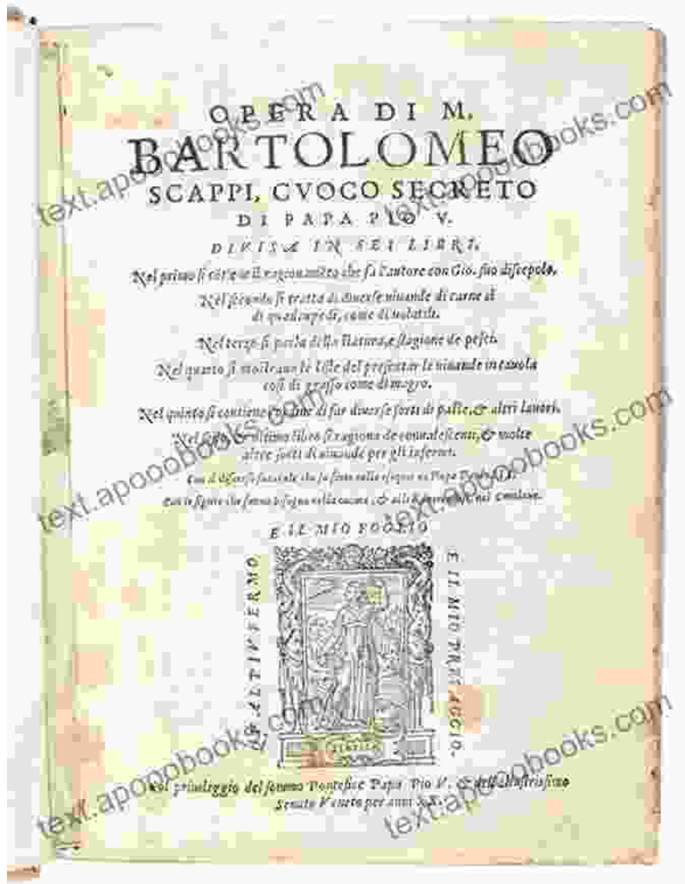
A recipe for roasted peacock from The Opera Of Bartolomeo Scappi 1570