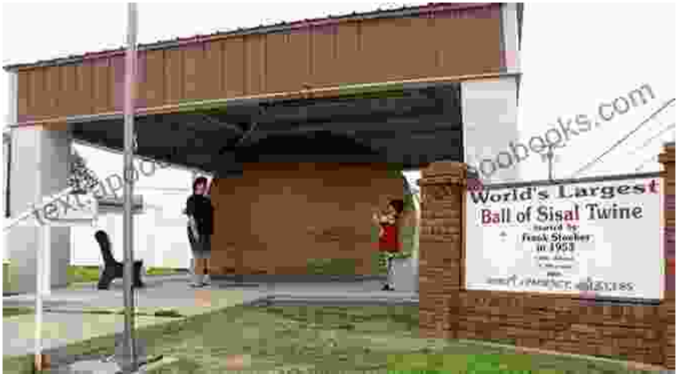
The World's Largest Ball of Twine in Cawker City, Kansas.