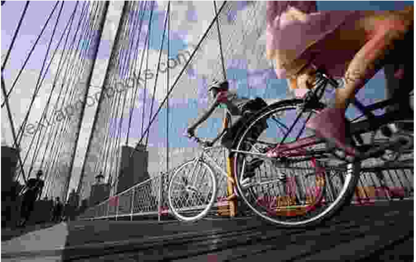
A group of cyclists riding down the Manhattan Bridge, with the Brooklyn skyline in the background, enjoying the city's iconic views.