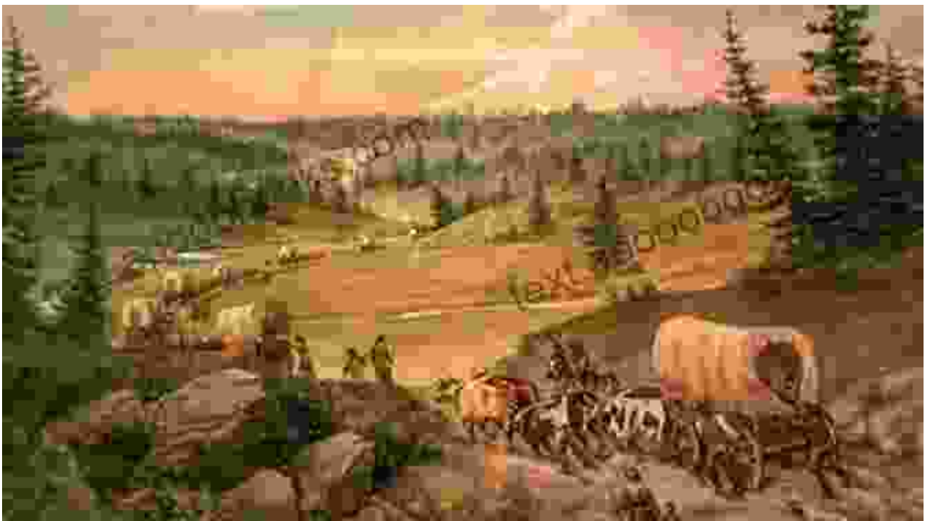
A traveler on horseback crosses a river in the American West in 1841.

Yet, amidst the splendor, nature also revealed its unforgiving side. Blizzards, torrential rains, and wildfires tested the limits of human endurance. Our traveler's descriptions of these challenges transport us into the heart of the wilderness, where the struggle for survival was a constant companion.