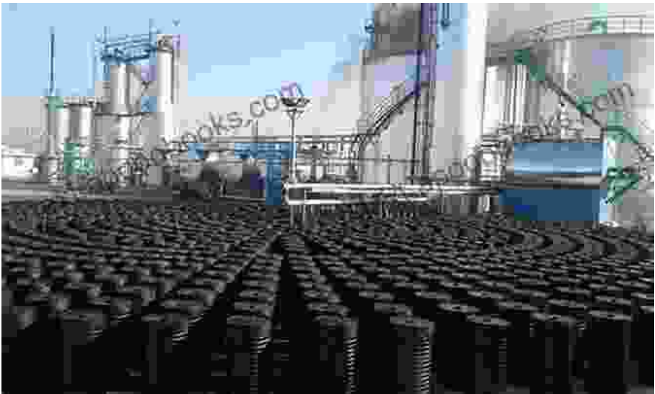
Bitumen production and processing facilities

Master the operational aspects of bitumen extraction, production, and distribution. Discover innovative technologies and techniques that enhance efficiency, reduce costs, and ensure environmental sustainability. Learn how to manage supply chains, optimize logistics, and maintain high-quality standards.