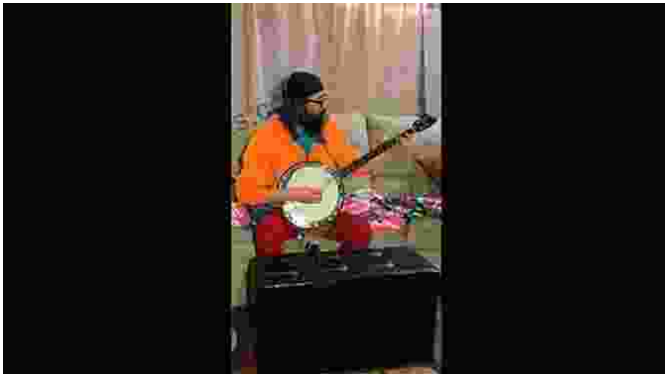
Earl Scruggs performing a banjo solo, circa 1950.

The advent of radio and commercial recordings played a crucial role in popularizing banjo solos. Banjoists from across the United States could now share their music with a wider audience. Recording artists such as Earl Scruggs and Bill Monroe emerged as stars of the emerging bluegrass music scene, and their innovative soloing styles influenced generations of banjo players.