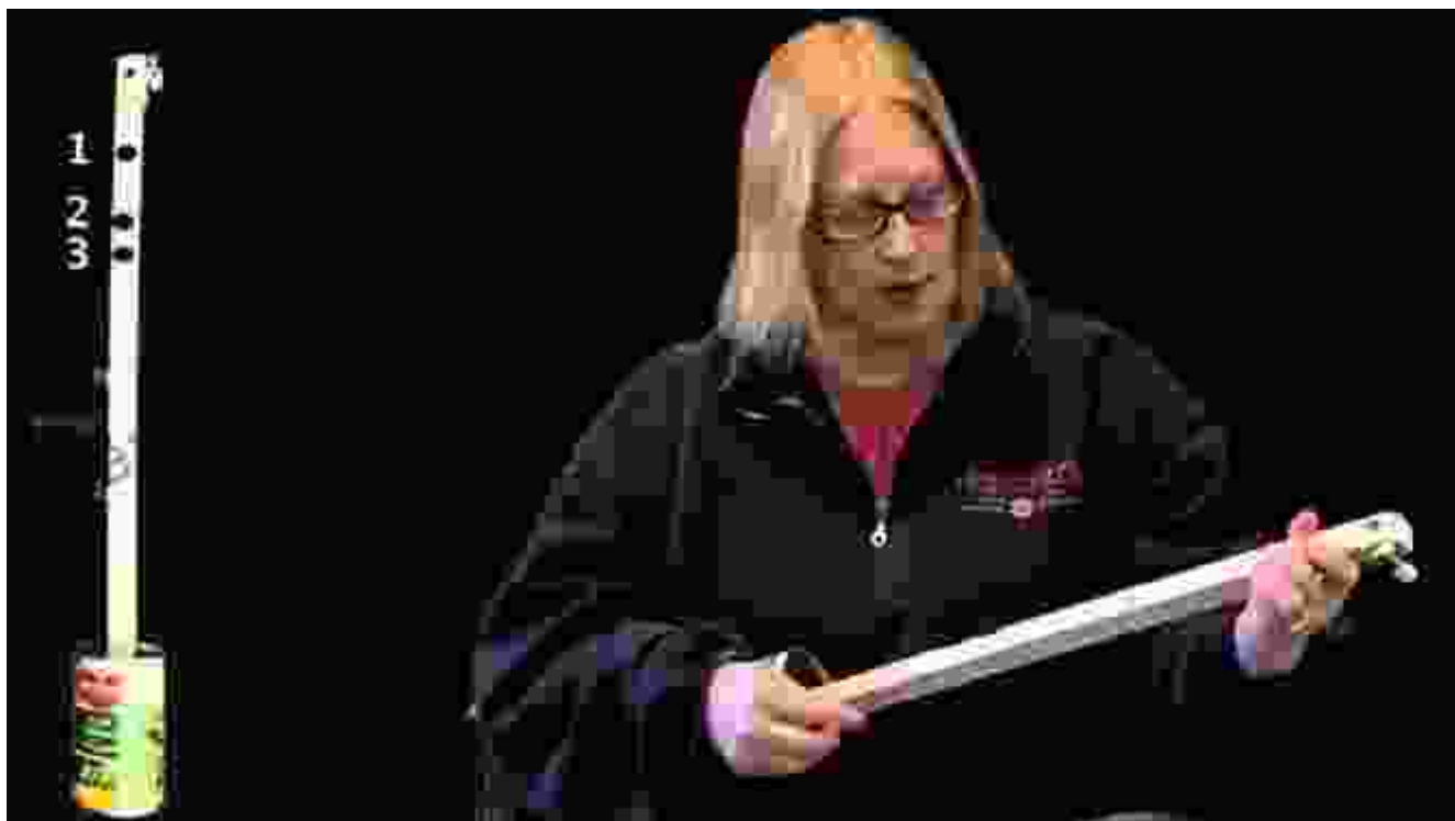
Figure 1: Anatomy of the Canjo

The Canjo is a remarkable fusion of two instruments, the banjo and the drum. Its construction involves a banjo body with a drumhead stretched over the top, creating a unique combination of percussive and melodic capabilities.