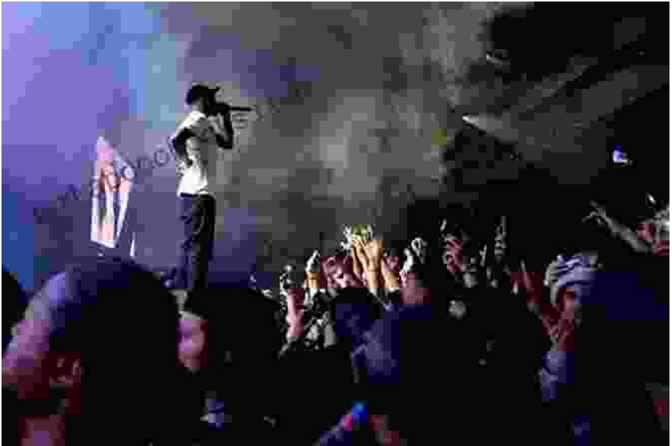
A hip-hop artist performing live, mic in hand

The late 1970s and early 1980s witnessed the rise of hip-hop culture in Britain, a movement that transformed street culture and influenced youth around the world. Inspired by New York City's hip-hop pioneers, British artists like Grandmaster Flash, Afrika Bambaataa, and the Sugarhill Gang emerged as innovators in the genre.