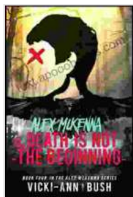
Image alt: A visually captivating cover of Alex McKenna and Death Is Not the Beginning, featuring a silhouette of Alex McKenna standing against a backdrop of swirling colors and cryptic symbols.

Free Download your copy today and embark on an extraordinary literary adventure like no other.